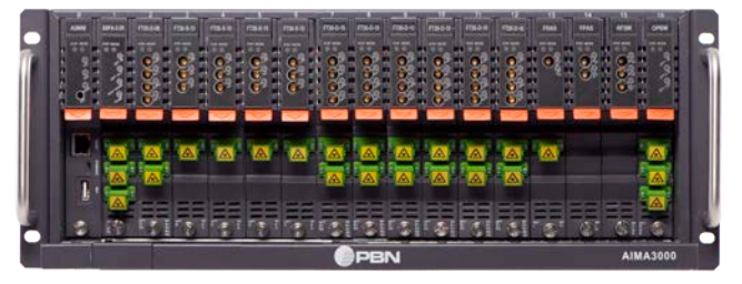
A-ACHA-4U (Example Product - Original)